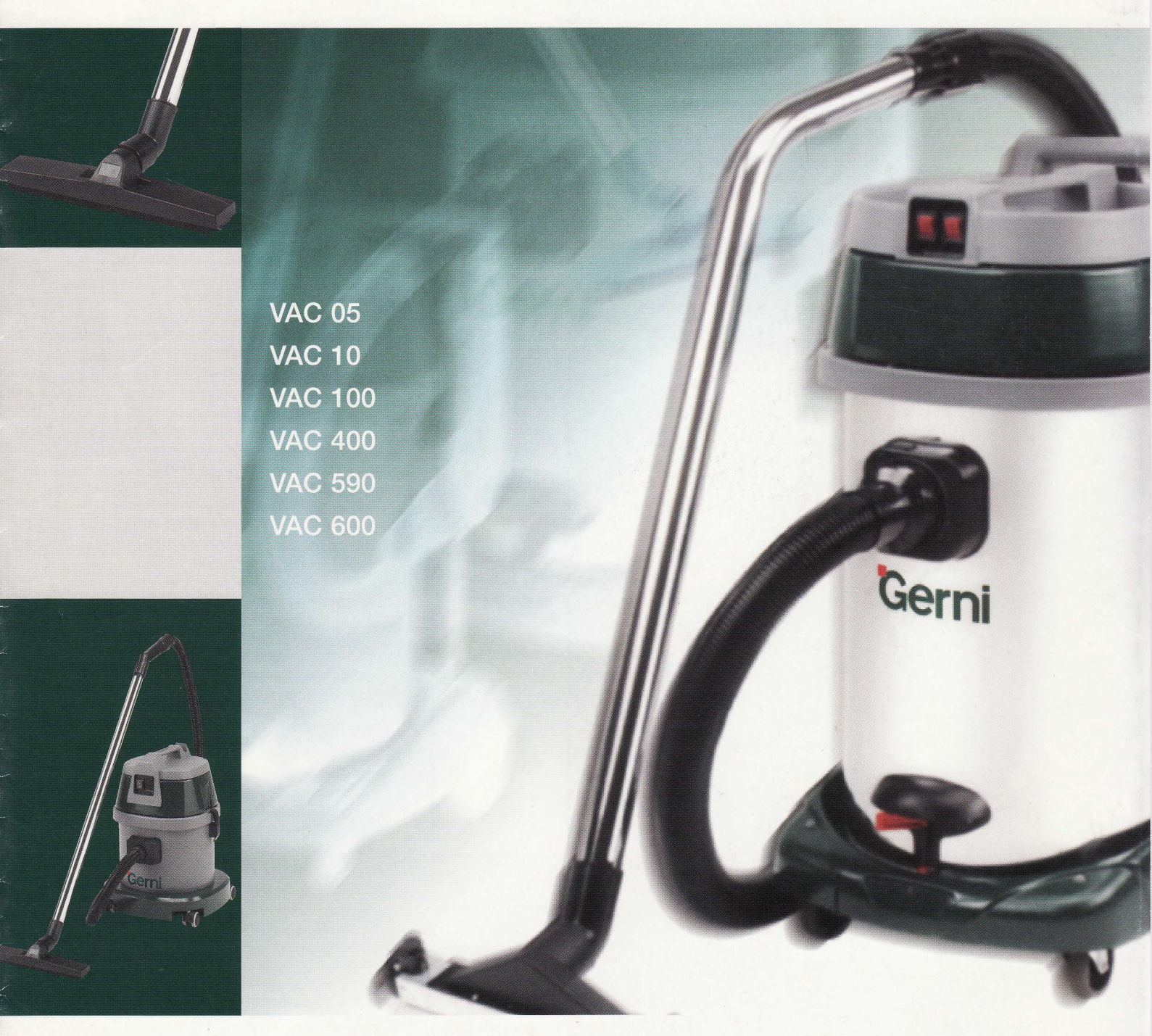
The Vac range